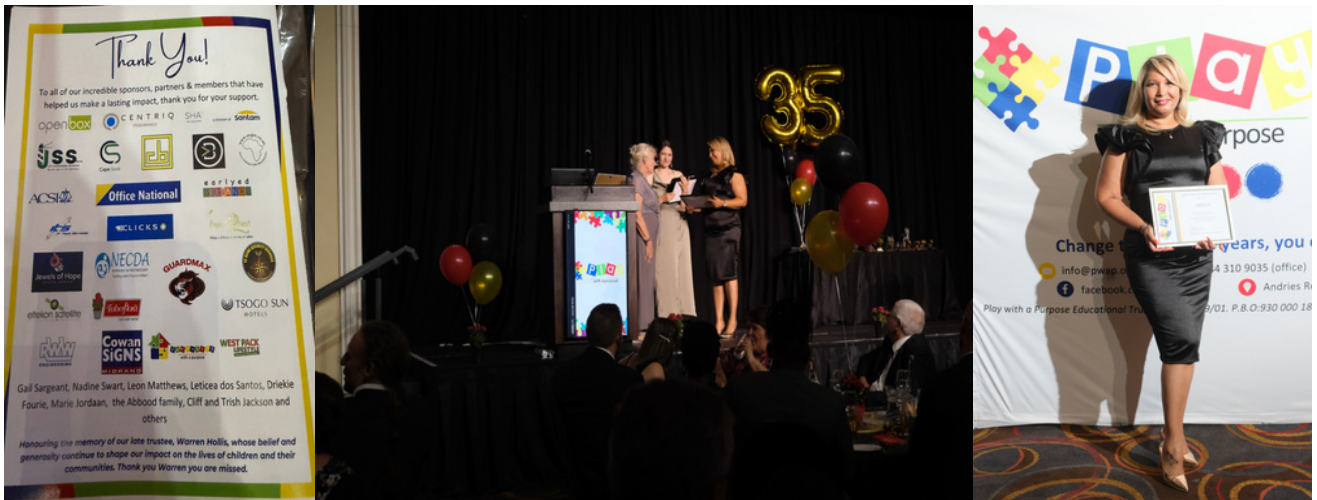
NECDA Appreciation Award at PWAP Annual Awards Ceremony