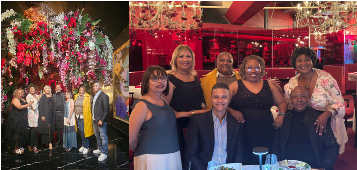
NECDA Board Pre Conference Appreciation Dinner