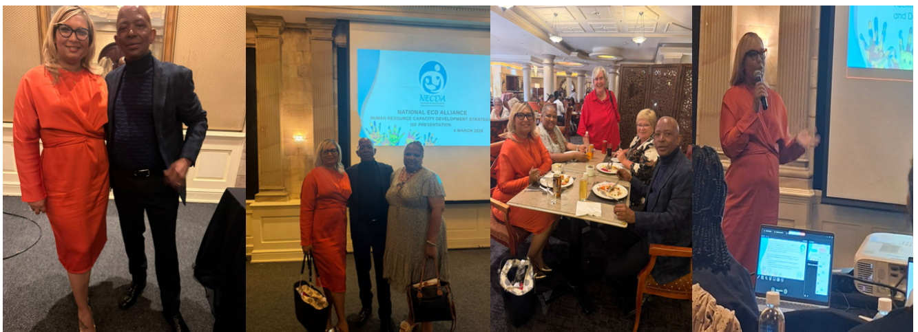
NECDA Presentation at the DBE ISF Meeting