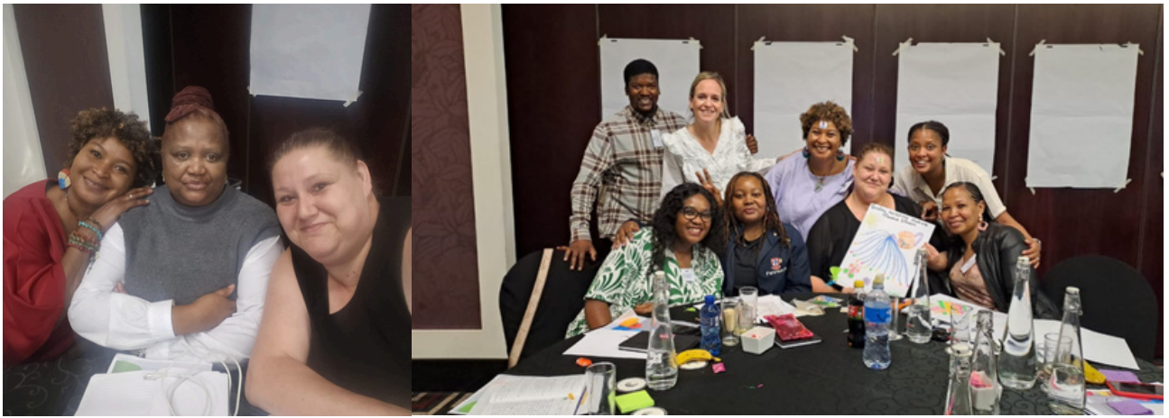
NECDA Board Members at HCI Workshop