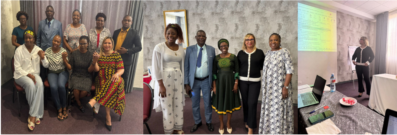
Eswatini AFECN SANECD Regional Engagement